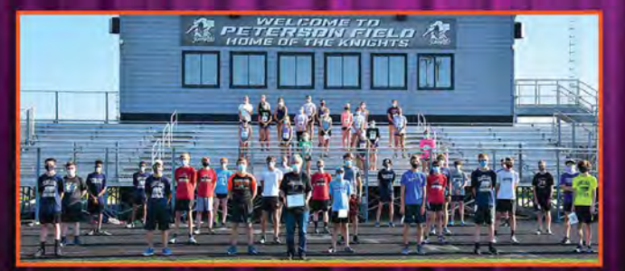
Kaneland: We value our partnership with Marklund very much. We realize that both the smiles of your clients, as well as your staff, that our days on site are appreciated. In turn, what we learn and gain from the experiences carry over to our own work to get students outside their comfort zones, and to put others before themselves.

Chapelstreet Church: We are thrilled to partner with Marklund on your mission!