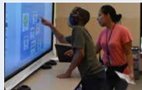
A state-of-the-art educational facility, MDS provides access to the latest in technology, including computers equipped with accessible switches and adapted programs, iPads, Prowise SMART boards.

At Marklund Day School, it "takes a village" – specially trained staff – to help make that possible. At current count, 17 teachers and 33 paraprofessionals and 12 registered behavior technicians provide very specialized education to the students with the assistance of instructional coaches, nurses,