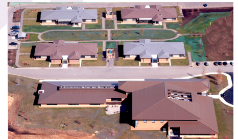
Aerial view of new campus