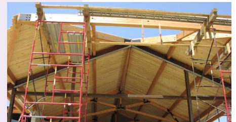
Constructing Hyde Center atrium

Many of our employees who took part in this milestone move are still on staff today, happy to share their memories in our CareLetter as well as our website at www.marklund.org/20years .