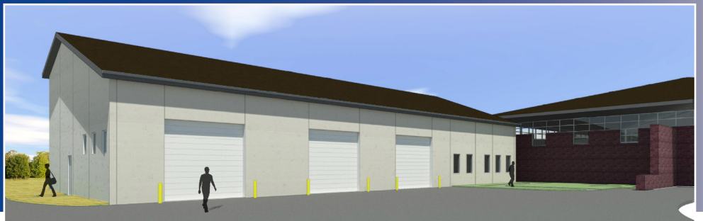
Excavation is well underway for the construction of the new maintenance garage and locker room expansion in Geneva.