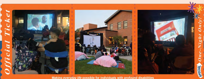
Making everyday life possible for individuals with profound disabilities

The more the merrier at Movies with Marklund - Feel free to share this event with friends and