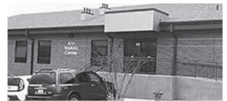
Marklund Day School - Bloomingdale

The Life Skills Program provides individualized functional curriculum and supports for students who are diagnosed on the Autism Spectrum, those with emotional/behavioral disorders, specific learning disabilities and developmental disabilities.