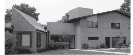
Marklund Philip Center

Skilled nursing and Community Day Services facility for 21 infants, children and adult includes a comprehensive active treatment program that provides for the intensive medical, social, emotional and physical needs of residents.