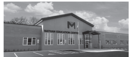
Nathan Education Center

The 16,000-square-foot site features classrooms for the Bridge Builder Community Day Services (CDS) program for adults in the community needing program support, as well as additional classrooms for Marklund Day School's Life Skills program.