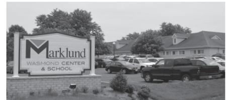
Marklund Wasmond Center

Skilled nursing and intermediate care facility for 61 children and adults with profound developmental disabilities. The five-acre campus includes the residential facility and the Community Day Services area. Additional services: comprehensive respiratory services, therapeutic social, recreational and community activities, plus two Marklund Day School - Elgin classrooms for students in the Multi-Needs Program.